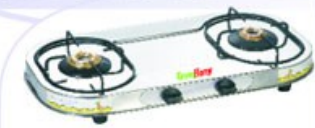
MEGA 2B - MRP . 3,495 /-