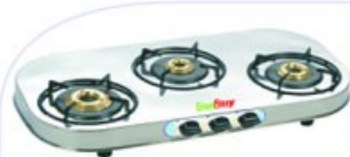
MEGA 3B - MRP . 4,895 /-