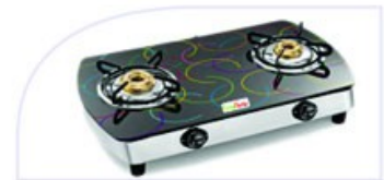
Opal-2B-Rainbow- MRP ₹. 6445 /-