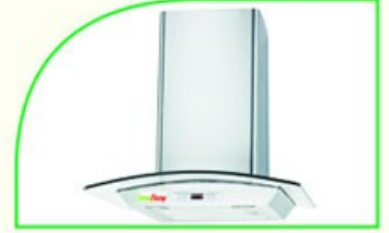
Diamond 60GT-Touch MRP ₹.22990/-