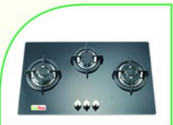
Eropa 3BGT- MRP ₹.14990/-