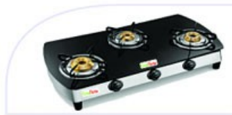
Opal 3B- MRP ₹. 6445 /-