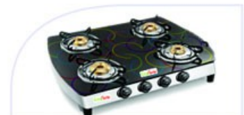
Opal-4B-Rainbow- MRP ₹. 9445 /-