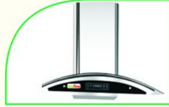
Motion 90GT-Touch- MRP ₹.24950/-