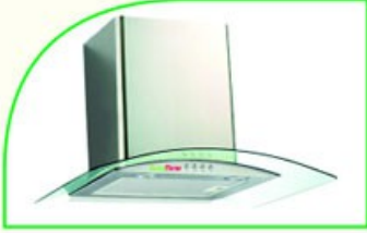
Diamond 60GT- MRP ₹.18995/-