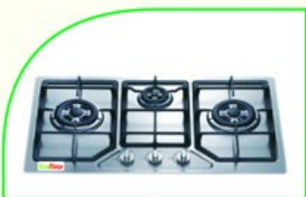
Eropa 3BSS- MRP ₹.12990/-