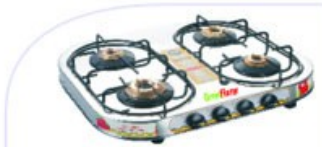
MEGA 4B - MRP . 5,895 /-