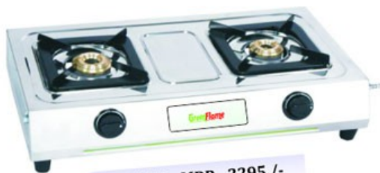
NOVA 2B - MRP . 2,295 /-