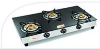
Popular 3B- MRP ₹. 5945 /-