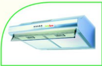
Slide 60SS- MRP ₹.7990/-