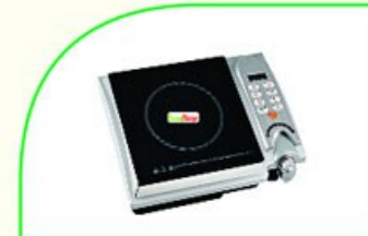
Micro MRP ₹.3895/-