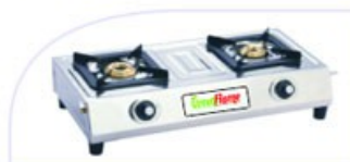
NOVA DX 2B- MRP ₹. 2,495 /-