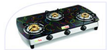
Opal-3B-Rainbow- MRP ₹. 7445 /-