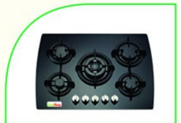
Eropa 5BGT- MRP ₹.17990/-