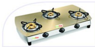
Opal-3B-Gold- MRP ₹. 7445 /-