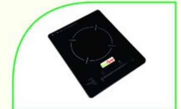
Micro-Touch MRP ₹.4995/-