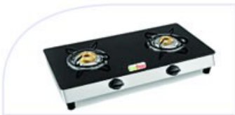
Popular 2B- MRP ₹. 4945 /-