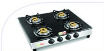
Popular 4B- MRP ₹. 7945 /-