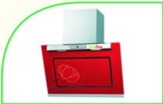
RoseBeauty 70SS- MRP ₹.25990/-