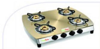
Opal-4B-Gold- MRP ₹. 9445 /-