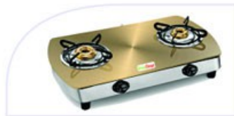
Opal-2B-Gold- MRP ₹. 6445 /-