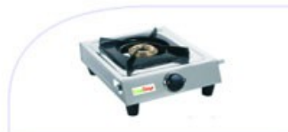
NOVA 1B- MRP ₹. 795 /-