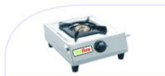
NOVA DX 1B- MRP ₹. 995 /-