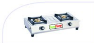
MINI 2B- MRP ₹. 2,195 /-