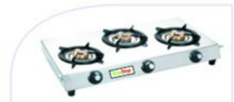
NOVA 3B- MRP ₹. 3,995 /-