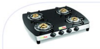
Opal 4B- MRP ₹. 8445 /-