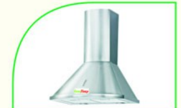
Vital 60SS- MRP ₹.16990/-