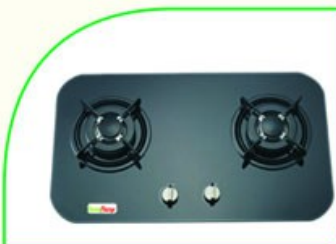
Eropa 2BGT- MRP ₹.11990/-