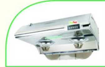
Auto Clean 60SS- MRP ₹.9990/-