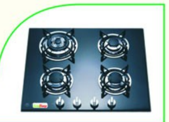
Eropa 4BGT- MRP ₹.16990/-