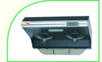
Auto Clean 60BK- MRP ₹.8990/-