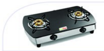
Opal 2B- MRP ₹. 5445 /-