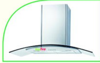
Motion 90GT- MRP ₹.22995/-