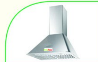
Devine 60SS- MRP ₹.15990/-