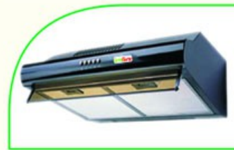
Slide 60BK- MRP ₹.6990/-