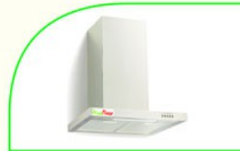
Elite 90SS- MRP ₹.19990/-