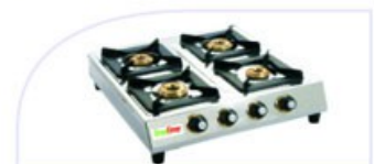
NOVA 4B- MRP ₹. 5,195 /-